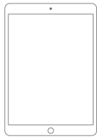
iPad Air 2 16GB 64GB 128GB

Maroo 3109 NE 109th Ave. Vancouver, WA 98682 360-883-0333 phone 360-883-4888 fax